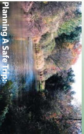
Planning A Safe Trip: